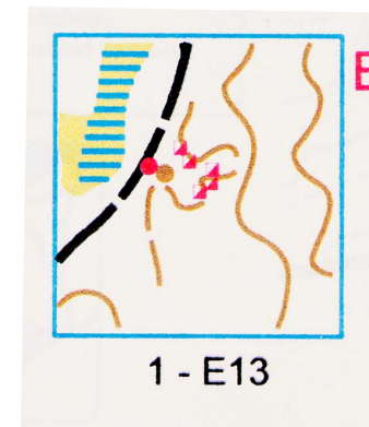
Control descriptions (as used internationally in all Orienteering competitions)