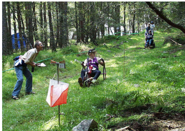
Competitors studying Control 13, with a Foot Orienteering marker in the foreground